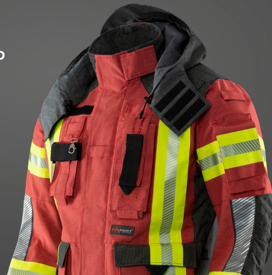
Fig. GUARDIAN RSQ jacket, PA06, 539 with hood, PA06, 203