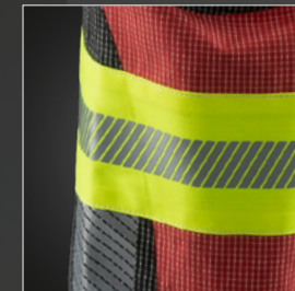
TEXPORT TRIPLE FABRIC

The TEXPORT Triple Fabric® is a textile reflective stripe that is made from fabric and therefore is extremely breathable and more durable. The reflective, silver-stripe material composition, patented by 3M*, adheres very well to the structure of the soft fabric. In addition, the TEXPORT Triple Fabric® is abraded less severely through wear and washing.