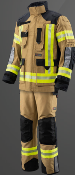
Nomex® NXT gold / dark blue 535