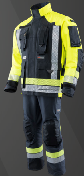
Nomex® NXT dark blue / HiVis yellow 523