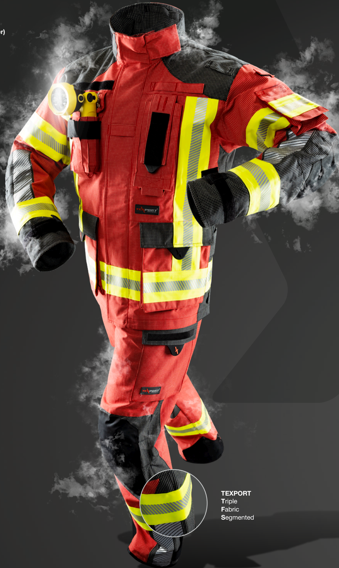
TEXPORT Triple Fabric Segmented