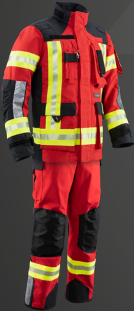
Nomex® NXT red / dark blue 539