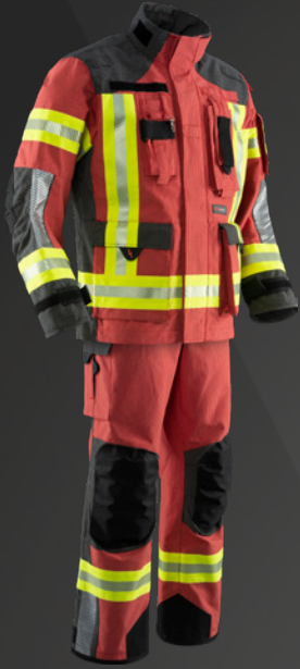
IB-TEX® red / dark blue 539