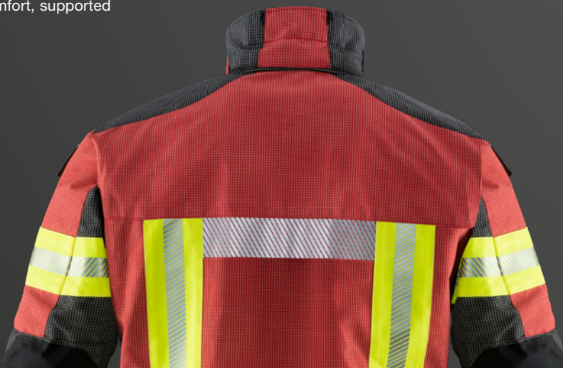
Fig. GUARDIAN RSQ, PA06, 539

X-TREME® light is made up of three layers: outer layer, intermediate layer (Heat Comfort Barrier) and membrane / flamliner (GORE-TEX® Flamliner® G and GORE-TEX® moisture barrier with GORE® CROSSTECH® product technology)