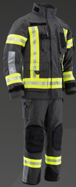
IB-TEX® dark blue / dark blue 502