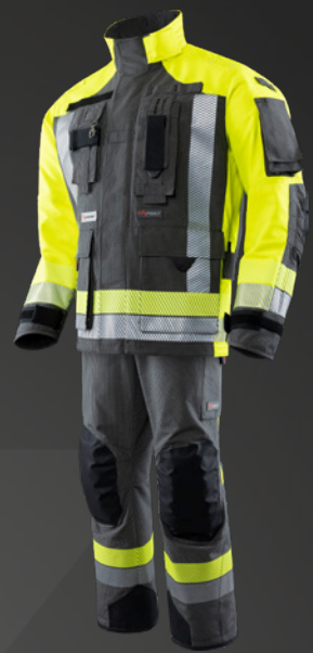
IB-TEX® dark blue / HiVis yellow 523