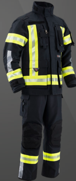
Nomex® NXT dark blue / dark blue 502