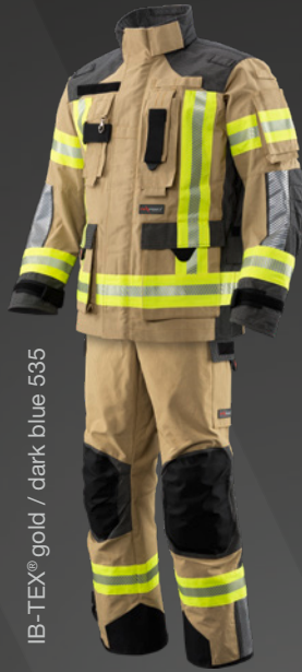
IB-TEX® gold / dark blue 535