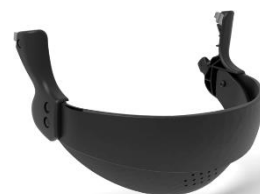
Black articulated mandible/jaw protection